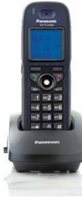
KX-TCA364 Tough Type Model