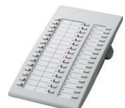
■ KX-T7740 DSS Console