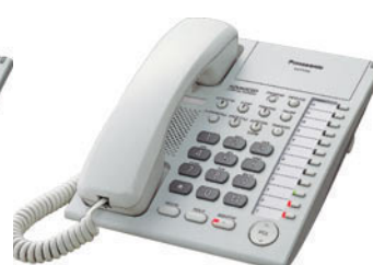
■ KX-T7750 Monitor Unit